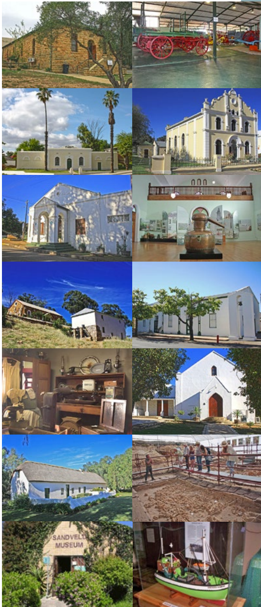
From top to bottom, left then right: Citrusdal, Ou Tronk, Darling, Goedverwacht, Hopefield, JC Smuts, Sandveld, Wheat Industry, Malmesbury, Piketberg, Jan Danckaert, Riebeeek Valley, West Coast Fossil Park, SA Fisheries, !Kwa ttu.