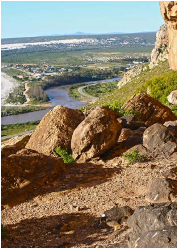
[5] Looking over Verlorenvlei at Elands Bay, the rock overhangs are littered with shells.