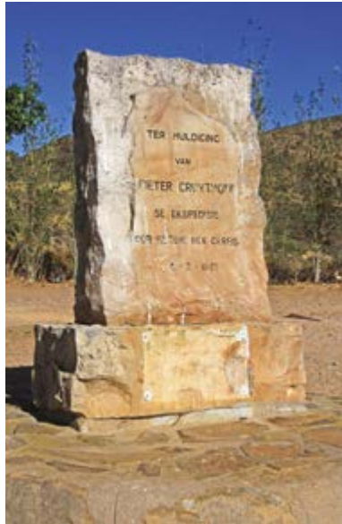
[14] The Pieter Cruythoff memorial on the Botmaskloof Pass overlooking the Riebeeek Valley. Consider the view that he and his party encountered, of wildlife beyond imagination.