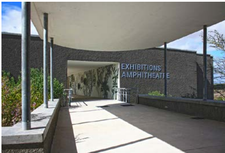
[7] Top: visitors exposed to the fossil remains. [8] Below: the impressive new entrance to the West Coast Fossil Park exhibition space. [9] Top right: working on the replica construction of extinct fauna from the west coast region.