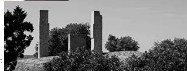
[10] The memorial to Vasco da Gama's landing at St Helena Bay in 1497.