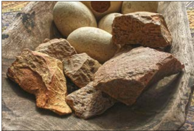
[2] Stone tools found in the Sandveld.