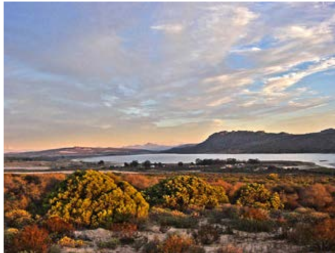
[24] Verlorenvlei, with the Cederberg in the background, a spectacular natural environment.