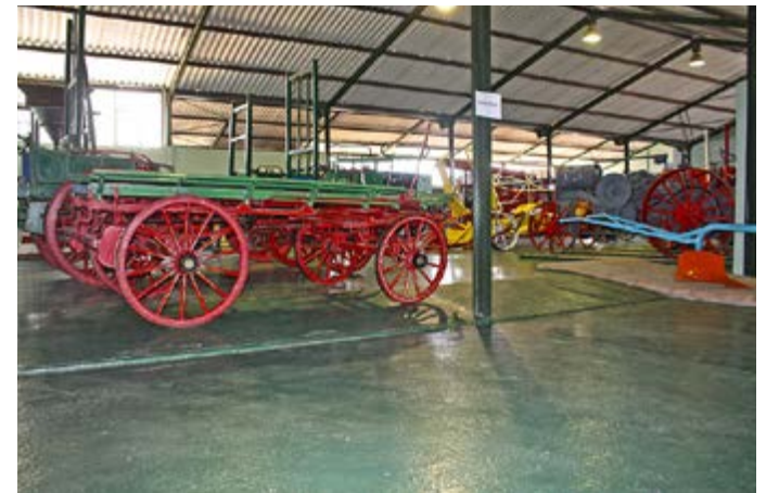
[21] The wheat Museum in Moorreesburg contains a unique installation, and is one of a group in the #Weskus depicting the heritage of the region.