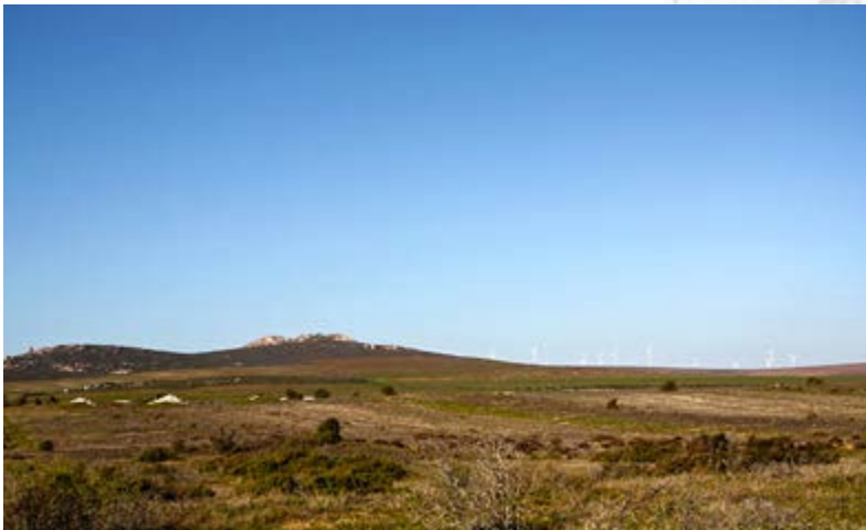
[3] Kasteelberg, near Paternoster, stands proud of the surrounding plain. Wind turbines contribute to the changing environment.

The #Weskus bears evidence of human occupation from the Earlier Stone Age (ESA), through Middle Stone Age (MSA) to the Later Stone Age (LSA).