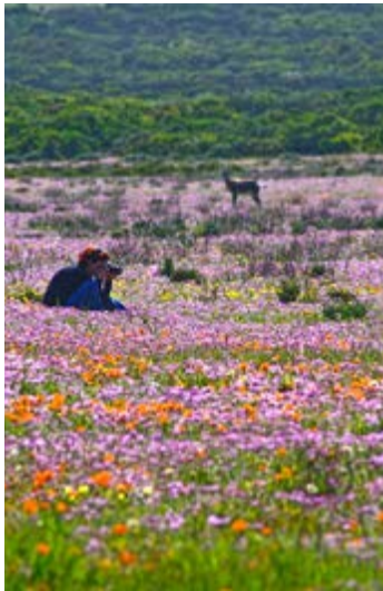
[23] The West Coast National Park erupts in splendour after winter rains. The park, a magnificent display of flora and fauna, also contains fossil remains, evidence of early human occupation in the form of footprints, to early settler architecture, literally taking us on a journey through time.