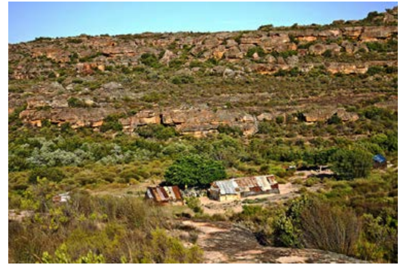
[20] This type of settlement deep in the Agter Cederberg has changed little over time.