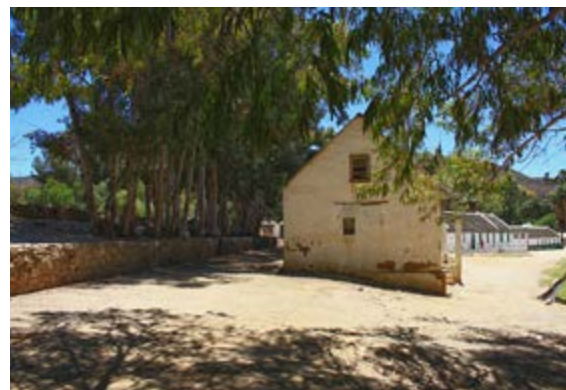
[17, 18, 19] Missionaries founded settlements such as Goedverwacht, Wupperthal and Saron.