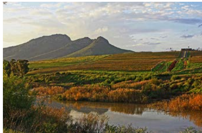
[11, 12, 13] Agriculture became a dominant economic activity in the #Weskus, dramatically altering the landscape.