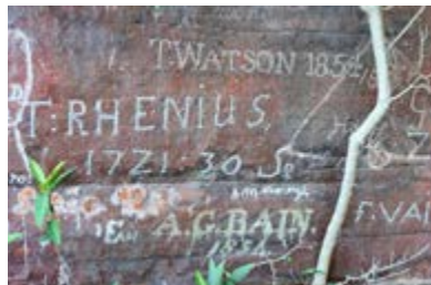
[15, 16] Many of the early adventurers passed by Heerenlogement, on their way north, leaving their 'calling cards' in the overhang, thus a record of their travels.